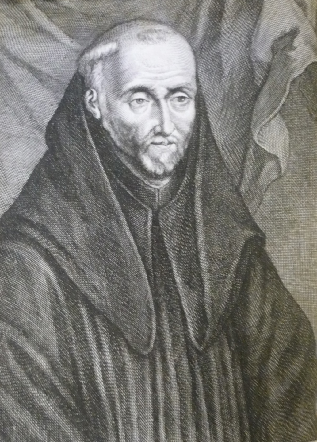
Augustine Baker, OSB